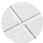
DUNE Second Look with PeakForm 24mm Exposed Grid