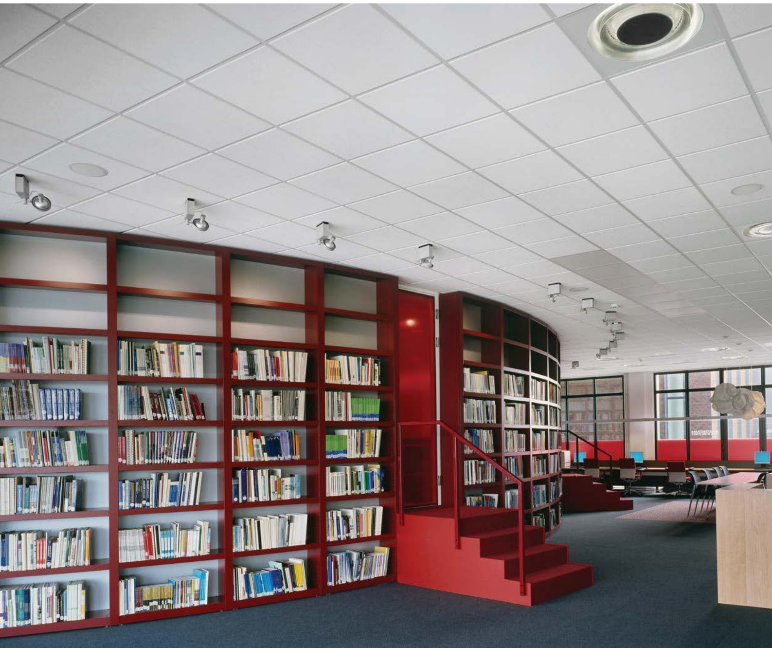
DUNE Second Look I with PEAKFORM 24mm Exposed Tee grid