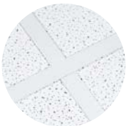
FINE FISSURED Ceramaguard with PeakForm 24mm Exposed Tee grid